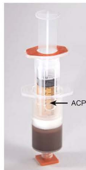
Figure 2. Image of syringe components with blood separated into the leukocyte-rich red blood cell pack and final injection syringe containing autologous conditioned plasma (ACP).

In a feasibility trial, the safety of a medical product concerns the medical risk to the subject, which is usually